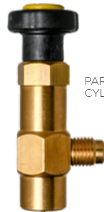
PART No. AC37 CYLINDER ADAPTOR